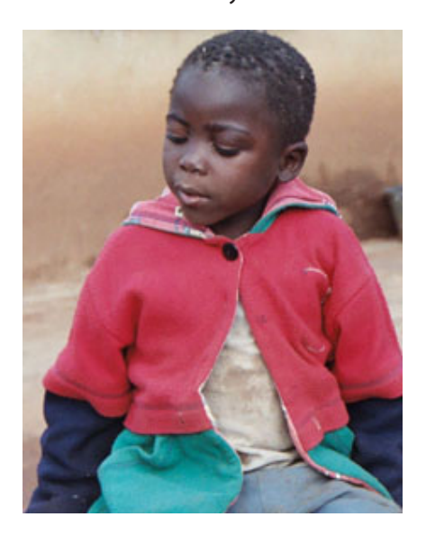
Kholeni - Vhutshilo Mountain School

Upon their return to the U.S. the three friends came together to devise a way to support much needed projects and programs that continue to provide medical, nutritional, and educational support to those affected by HIV/AIDS.