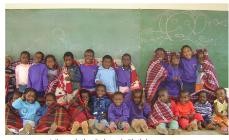
Vhutshilo School Children

www.hopeforlimpopo.org www.hopeforlimpopo.ning.com